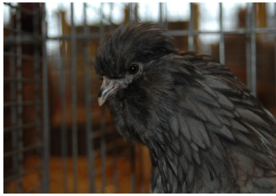
Barbu de Watermael hen black