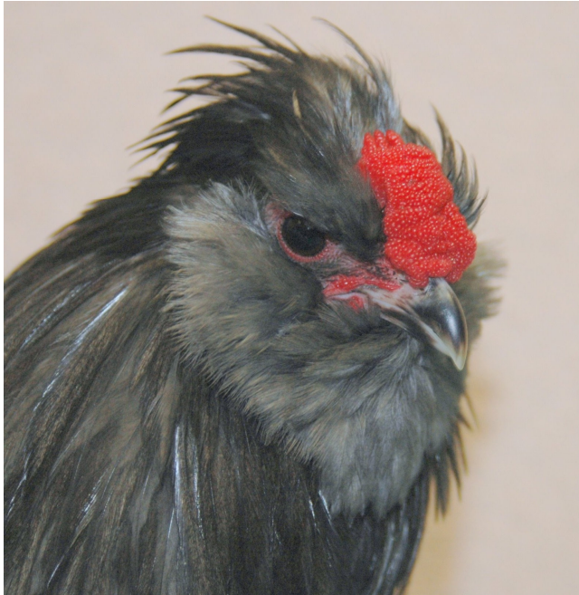
Barbu de Watermael cock blue

The back is pretty short, but with enough width between the shoulders.