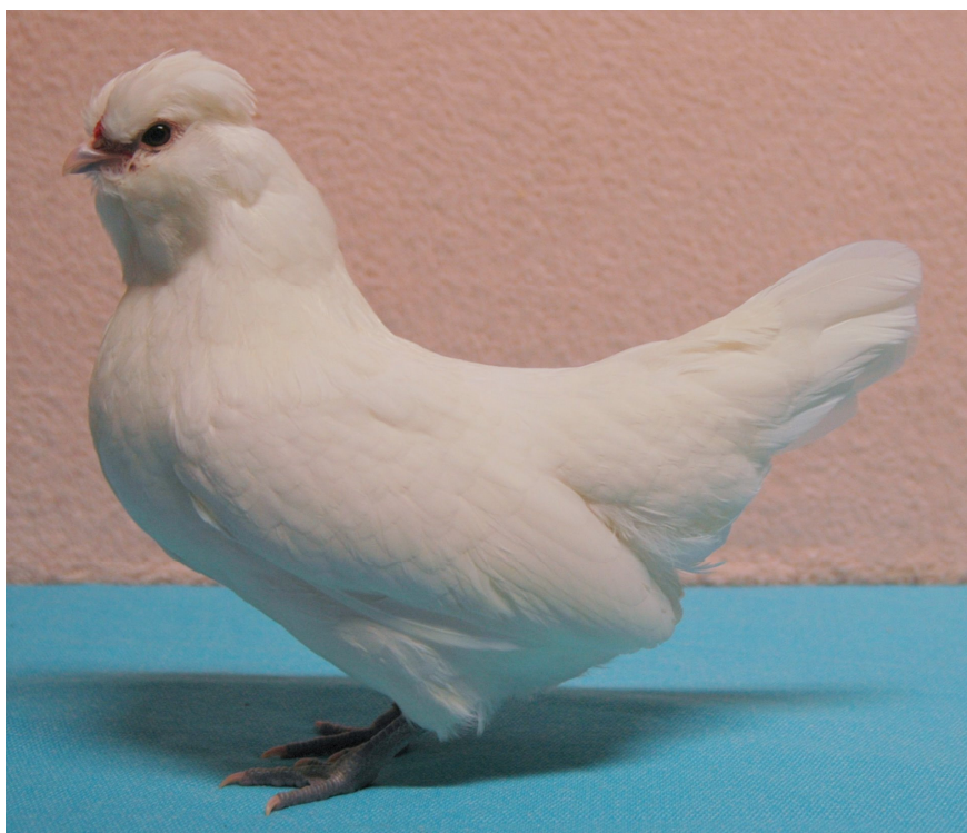
Barbu de Watermael hen white